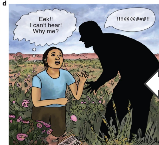
Illustration by Callie Rodgers Chappell

A deaf botanist is verbally abused due to her disability.