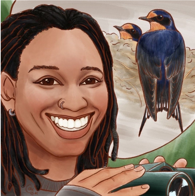
Art by Casey Girard, @caseygirard